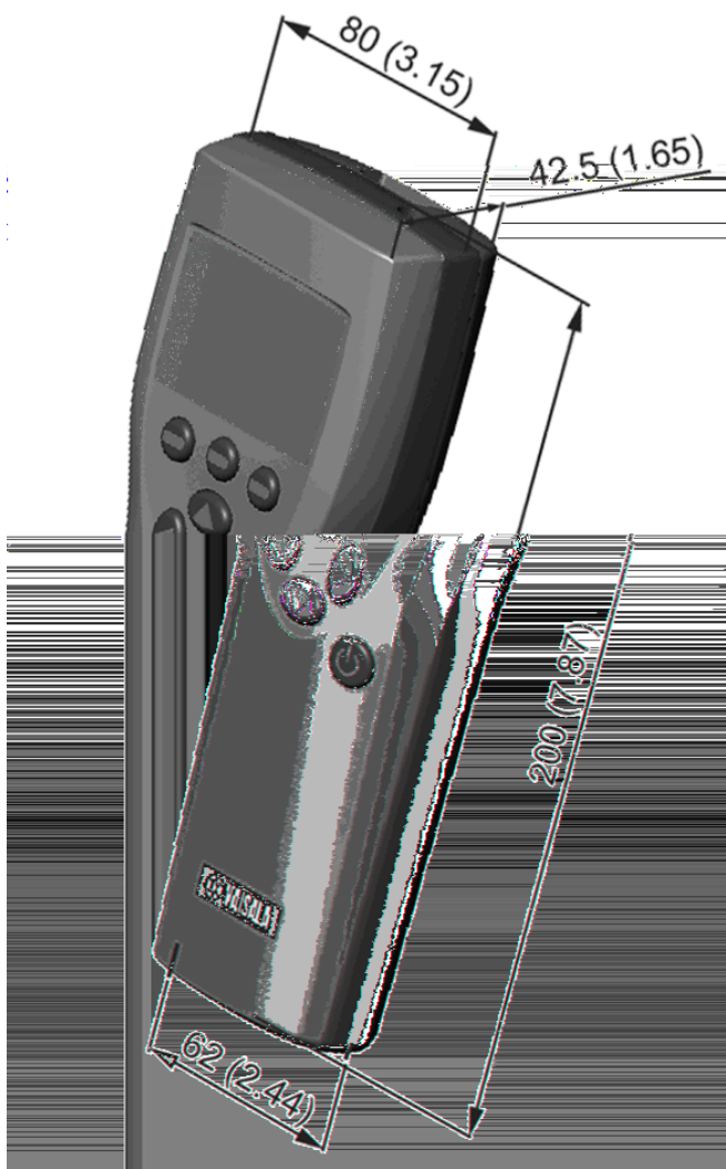
Indicator dimensions in mm (inches)